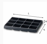
5003/12H - Matrix - Plastic tray