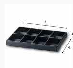
5003/8H - Matrix - Plastic tray