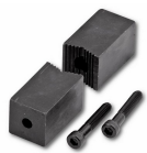
498 GD - Pipe clamp jaws