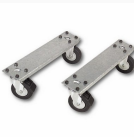
5002 S10 - Matrix - Wheel set for tool chests (2 pcs.)