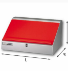
5002 S9 - Matrix - Inclined plan