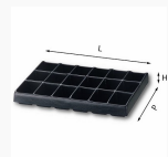
5003/18H - Matrix - Plastic tray