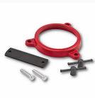
498 GE - Swivelling support