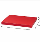
5002 Z1 - Spacer