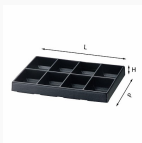
5003/8H - Plastic tray