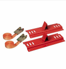
5002 S1 - Matrix - Holder