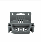
5002 S2 - Matrix - Holder