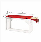
5002 ZM4 - Worktop with vice