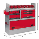
5006 C3 - Assortment for left side