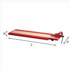
5002 ZM2 - Worktop with vice